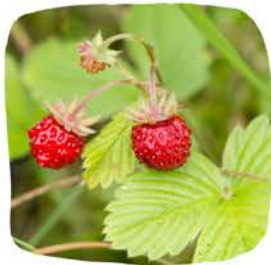
Strawberry / t̥qim̥t̥qm̥ / s̥q̥wo̥q̥w̥y̥ep

Seek out an Elder to share stories of gathering and join us on our next "On The Land" to reconnect with nature and self.