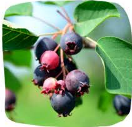
Saskatoon / scaq̥w̥m / siyaʔ