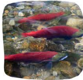
Sockeye Salmon / s̥x̥w̥áʔes / s̥c̥win