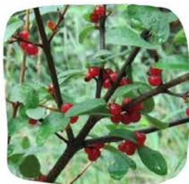
Soapberry / s̥x̥w̥úsm / s̥x̥w̥usəm

"MOTHER EARTH IS NOT a resource, SHE IS an HEIRLOOM"